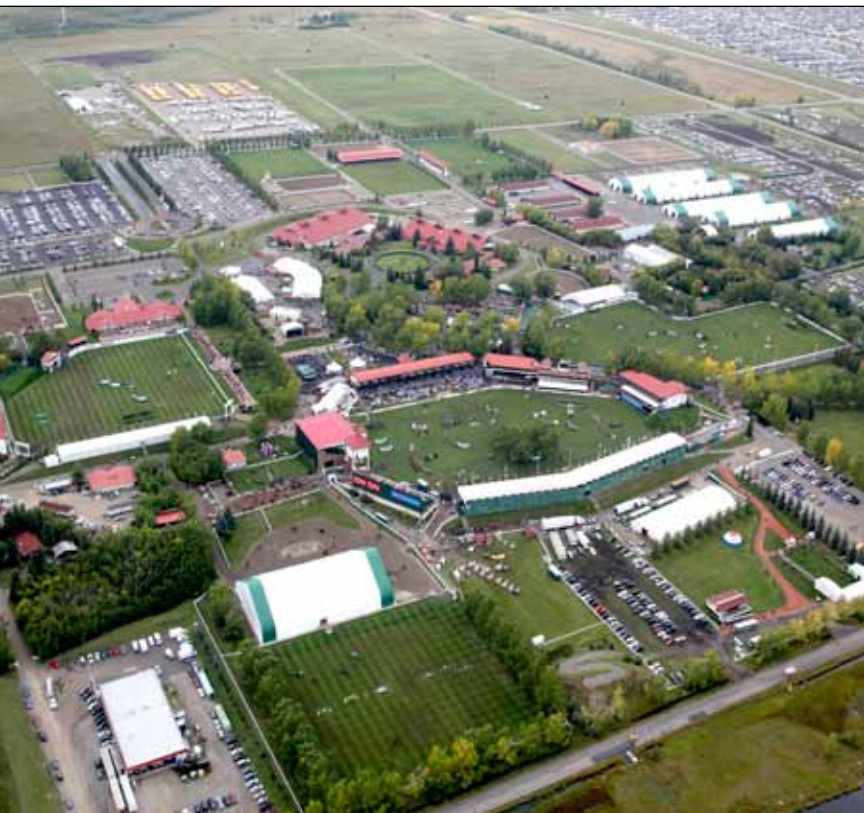
September 2010 aerial view at the "Masters" Tournament