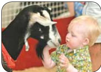
▲ The International Plaza offers many new experiences during the North American.