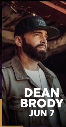
DEAN BRODY JUN 7