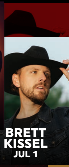
BRETT KISSEL JUL 1