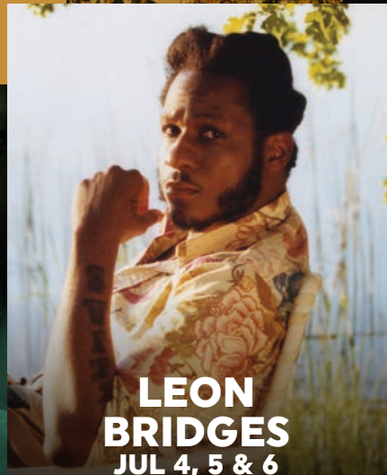
LEON BRIDGES JUL 4, 5 & 6