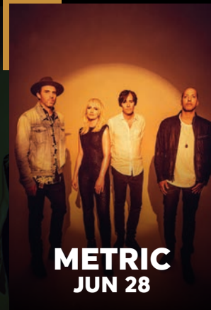
METRIC JUN 28