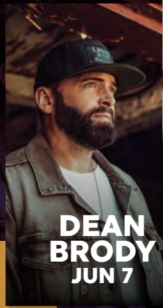
DEAN BRODY JUN 7