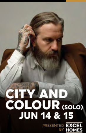
CITY AND COLOUR (SOLO) JUN 14 & 15