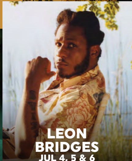
LEON BRIDGES JUL 4, 5 & 6