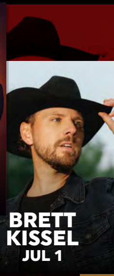
BRETT KISSEL JUL 1