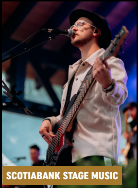
SCOTIABANK STAGE MUSIC