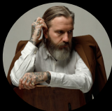
CITY AND COLOUR (SOLO)

FRIDAY & SATURDAY JUNE 14 & 15 DOORS: 7 P.M.