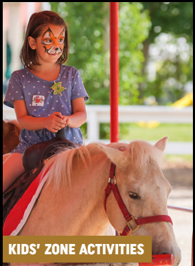
KIDS' ZONE ACTIVITIES