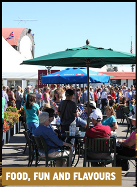
FOOD, FUN AND FLAVOURS