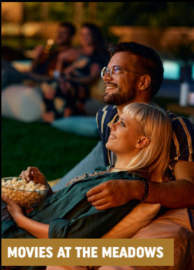
MOVIES AT THE MEADOWS